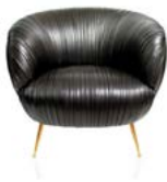
SOUFFLE CHAIR Ruched Lambskin Leather 34"W x 33"D x 32"H