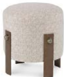
GRIFFITH STOOL Burnished Bronze / Upholstery / Pyrite 17"DIA X 19"H