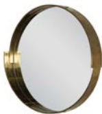
ALTA MIRROR Burnished Bronze / Glass 18"DIA X 3"D