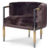
LARCHMONT CHAIR Burnished Bronze / Pewter Patina / Upholstery 30"W X 27"D X 29"H