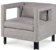
GREYSTONE CHAIR Blackened Stainless Steel / Upholstery 30"W X 30"D X 28"H