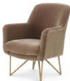
BAILEY CHAIR Burnished Bronze / Upholstery 27"W X 28"D X 34"H