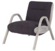
CAMDEN LOUNGE CHAIR Wirebrushed Wenge / Upholstery 28.5"W X 35"D X 32"H