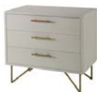
BAILEY DRESSER Burnished Bronze / Ash 33"W X 20"D X 30"H