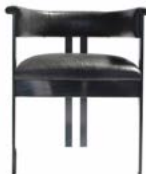
ELLIOTT CHAIR Leather Upholster / Solid Bronze 22.5"W X 18.5"D X 27"H