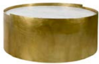
ALTA COFFEE TABLE Burnished Bronze / Marble 44"D X 18"H