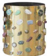
BAUBLE STOOL Burnished Bronze / Ash 16" Dia X 18" H