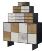
HUNTLEY CABINET Blackened Stainless Steel / Glass / Parchment 49.5"W X 18"D X 59"H