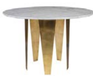
GRAFTON TABLE Steel / Gold Leaf / Marble 42"DIA X 30"H