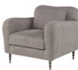
HILLCREST LOUNGE CHAIR Burnished Bronze / Upholstery 32"W X 38"D X 34"H