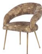
LAUREL CHAIR Burnished Bronze / Upholstery 24"W X 25"D X 32"H