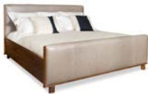
TROUSDALE BED Walnut / Leather 83"W X 88"D X 50"H