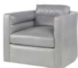
MELROSE CLUB CHAIR Ebonized Walnut / Upholstery 23"W X 23"D X 32.75"H