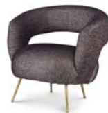
LAUREL LOUNGE CHAIR Burnished Bronze / Upholstery 32"W X 32"D X 32"H