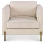
MELANGE CLUB CHAIR Burnished Bronze / Upholstery 34"W X 36"D X 30"H