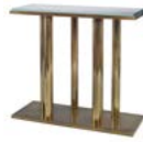
HOLMBY CONSOLE Burnished Bronze / Glass 36"W X 14"D X 32"H