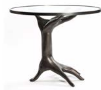
DICHOTOMY TABLE Cast Bronze / Tempered Glass 36" Dia X 30" H