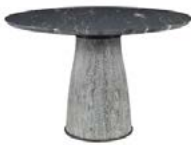
CAMDEN TABLE Wirebrushed Wenge / Marble 48"DIA X 30"H