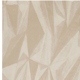
COVET PARCHMENT GWP 3718.116