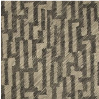
VERGE EBONY/IVORY GWP 3702.18