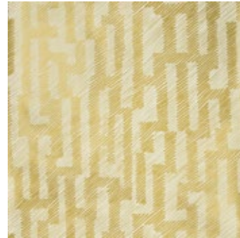
VERGE GILDED/IVORY GWP 3702.140