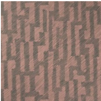
VERGE PINOT/NOIR GWP 3702.78