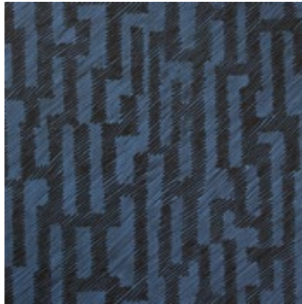
VERGE EBONY/COBALT GWP 3702.58