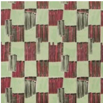
LYRE LOTUS GWP 3722.319