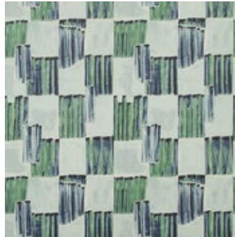
LYRE POOL GWP 3722.153