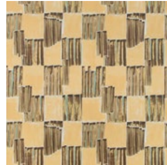
LYRE BRONZED GWP 3722.166