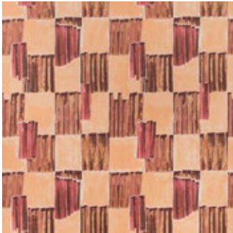
LYRE FIERY GWP 3722.119