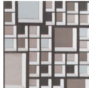
RARITY MOCHA/NOIR GWP 3700.868