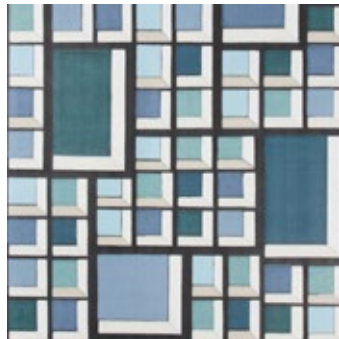
RARITY PACIFIC/NOIR GWP 3700.853