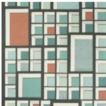
RARITY JADE/NOIR GWP 3700.893

This image is for illustrative purposes only. The colors shown are accurate within the constraints of lighting, photography and the color accuracy of your monitor.