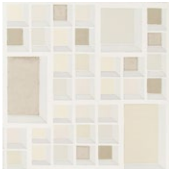
RARITY ALMOND/IVORY GWP 3700.116