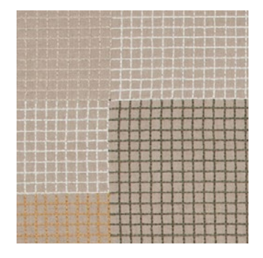
GRIDLOCK FABRIC MOCCASIN