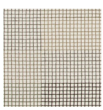
GRIDLOCK FABRIC VANILLA BEAN