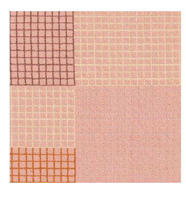
GRIDLOCK FABRIC CINNAMON