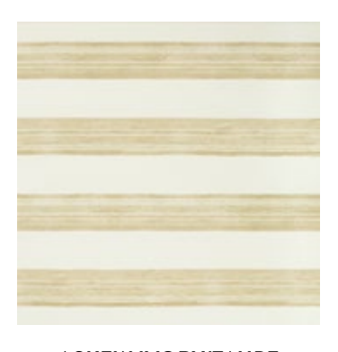
ASKEW IVORY/TAUPE GWP 3701.116