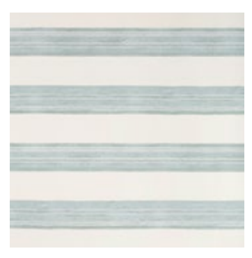
ASKEW IVORY/POOL GWP 3701.115