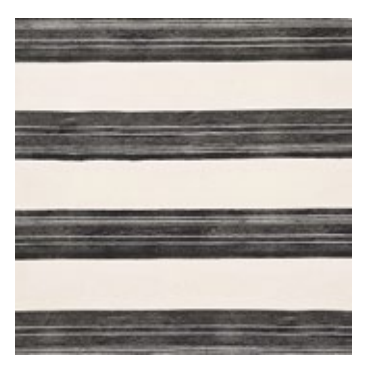
ASKEW IVORY/ONYX GWP 3701.18