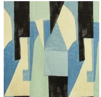
DISTRICT FABRIC COBALT GWF 3752-115