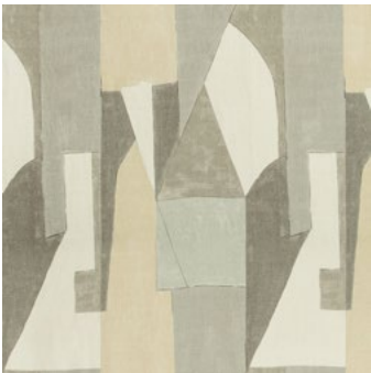
DISTRICT FABRIC ALABASTER GWF 3752-116