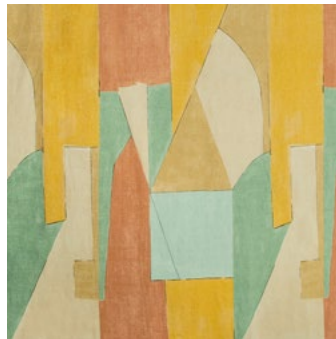
DISTRICT FABRIC TAWNY GWF 3752-134