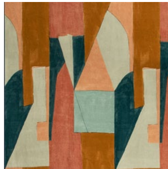
DISTRICT FABRIC APRICOT GWF 3752-357