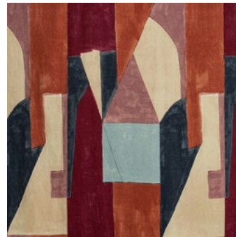
DISTRICT FABRIC CLARET GWF 3752-795