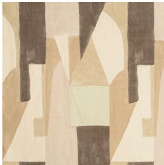
DISTRICT FABRIC SILT GWF 3752-167