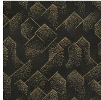
BRINK GOLD/ONYX GWP 3703.840