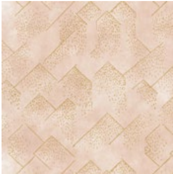
BRINK BLUSH/GOLD GWP 3703.174