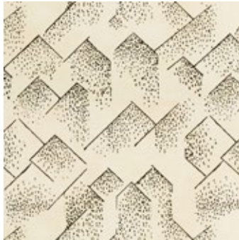
BRINK CREAM/ONYX GWP 3703.18