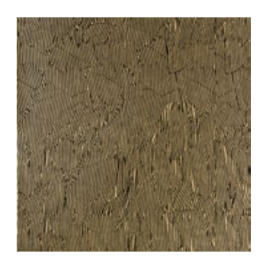
AVANT KRAFT/BLACK GWP 3500.168