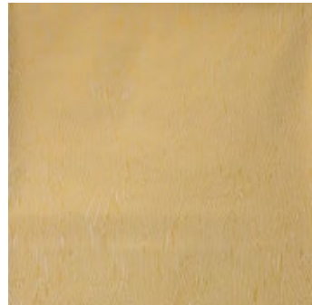
AVANT LINEN/GOLD GWP 3723.48