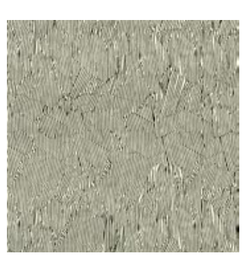
AVANT IVORY/BLACK GWP 3723.18