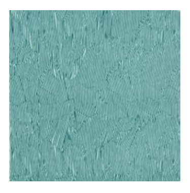
AVANT SKY/TEAL GWP 3723.68