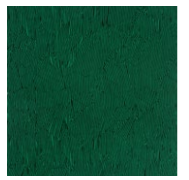
AVANT GREEN/BLACK GWP 3723.150