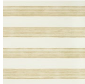
ASKEW IVORY/TAUPE GWP 3701.116