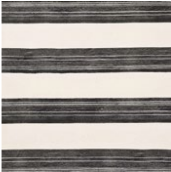
ASKEW IVORY/ONYX GWP 3701.18