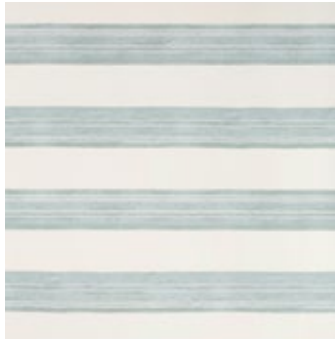
ASKEW IVORY/POOL GWP 3701.115