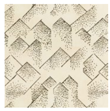
BRINK CREAM/ONYX GWP 3703.18