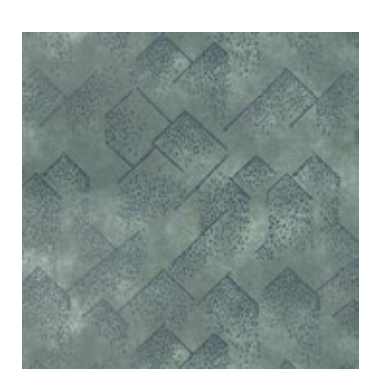
BRINK NAVY/SLATE GWP 3703.115