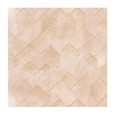
BRINK BLUSH/GOLD GWP 3703.174