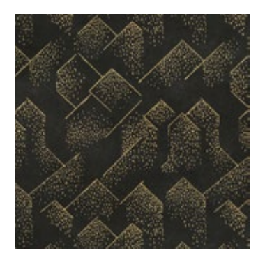
BRINK GOLD/ONYX GWP 3703.840