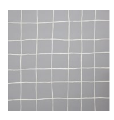
COQUETTE GREY/CREAM GWP 3503.111