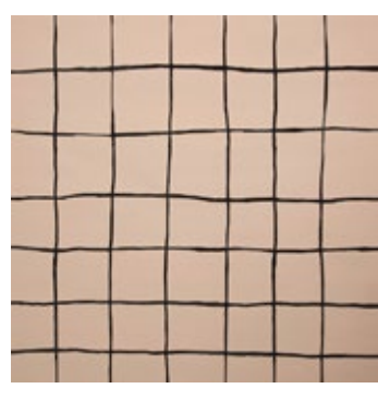
COQUETTE SHELL/BLACK GWP 3503.178