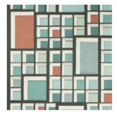
RARITY JADE/NOIR GWP 3700.893

This image is for illustrative purposes only. The colors shown are accurate within the constraints of lighting, photography and the color accuracy of your monitor.