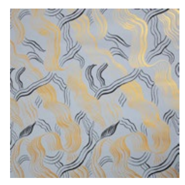
JUBILEE BLUE/GOLD GWP 3504.548