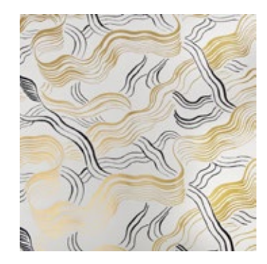
JUBILEE IVORY/GOLD GWP 3504.148