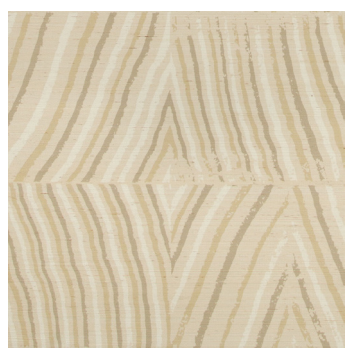
POST NATURAL GWP 3717.116