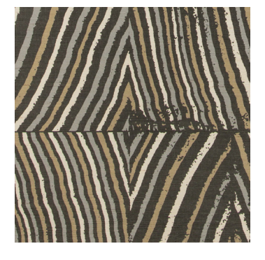
POST SHADOW GWP 3717.811