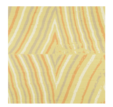
POST GLOW GWP 3717.401