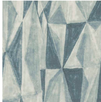
COVET FABRIC DENIM GWF 3722.511