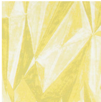
COVET FABRIC CITRINE GWF 3722.403