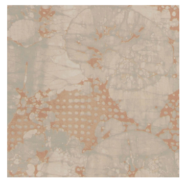
MINERAL ROGUE GWP 3719.711