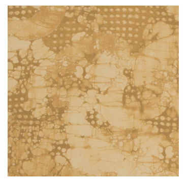
MINERAL BURNT UMBER GWP 3719.164