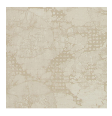
MINERAL WHITEWASH GWP 3719.116

This image is for illustrative purposes only. The colors shown are accurate within the constraints of lighting, photography and the color accuracy of your monitor.