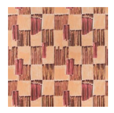
LYRE FIERY GWP 3722.119