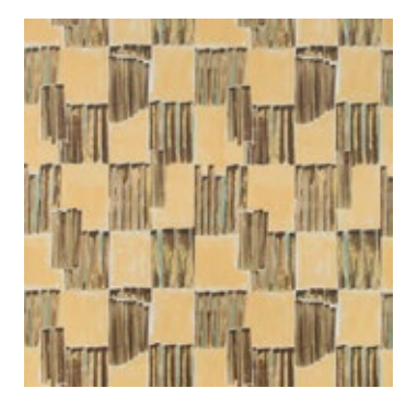
LYRE BRONZED GWP 3722.166