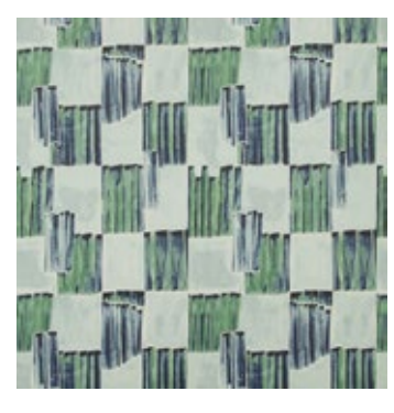
LYRE POOL GWP 3722.153