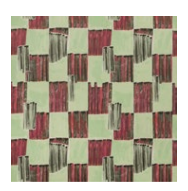
LYRE LOTUS GWP 3722.319