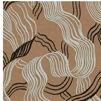
JUBILEE EMB FABRIC SHELL