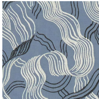
JUBILEE EMB FABRIC DUSK BLUE