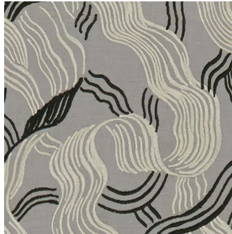
JUBILEE EMB FABRIC PEWTER