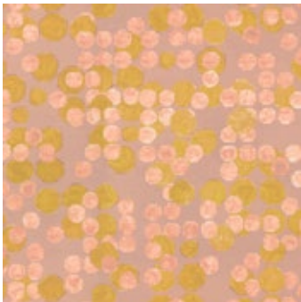
HEX AURA GWP 3724.174