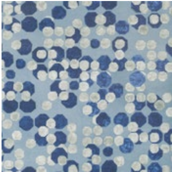
HEX MARINE GWP 3724.505