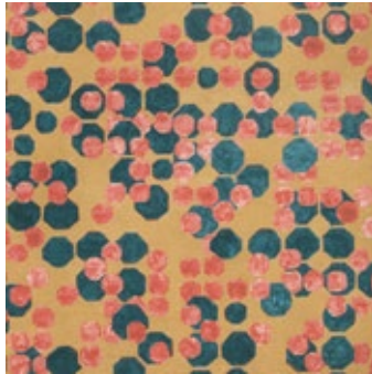
HEX ARIZONA GWP 3724.413