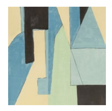
DISTRICT COBALT GWP 3721.115