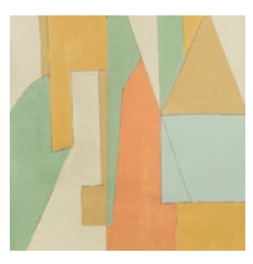
DISTRICT TAWNY GWP 3721.134