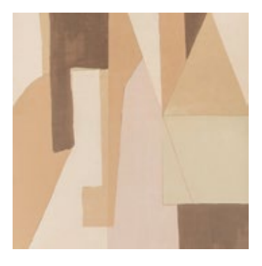
DISTRICT SILT GWP 3721.167