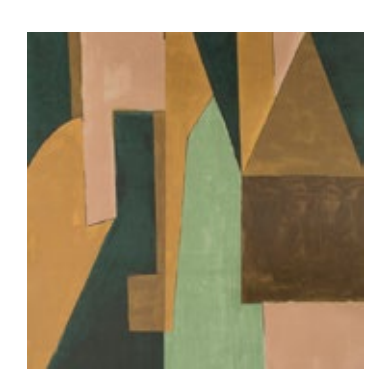
DISTRICT TOBACCO GWP 3721.376