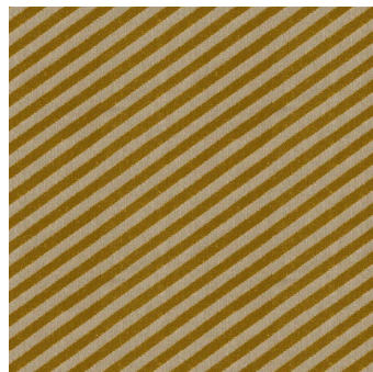
OBLIQUE FABRIC GOLD/OATMEAL GWF 3050-416