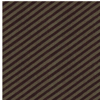
OBLIQUE FABRIC TRUFFLE/GREY GWF 3050-611