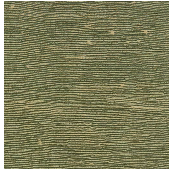
STROKE FABRIC PEARL/JADE GWF 3529-123