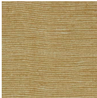
STROKE FABRIC PEARL/SAND GWF 3529-164