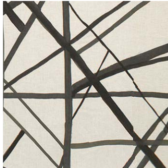
CHANNELS FABRIC EBONY/IVORY GWF 3101-816