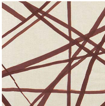
CHANNELS FABRIC PLUM/OATMEAL GWF 3101-911