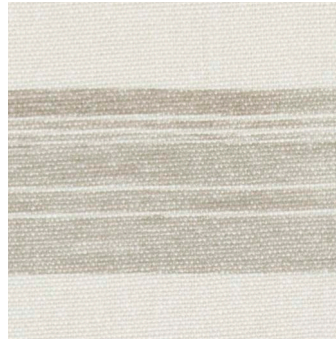
ASKEW FABRIC IVORY/TAUPE GWF 3724.116