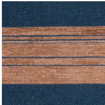
ASKEW FABRIC SIENNA/NAVY GWF 3724.524