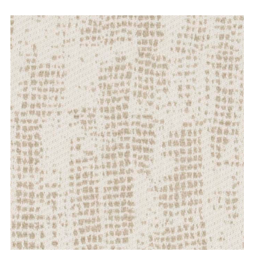
VERSE FABRIC IVORY/ECRU