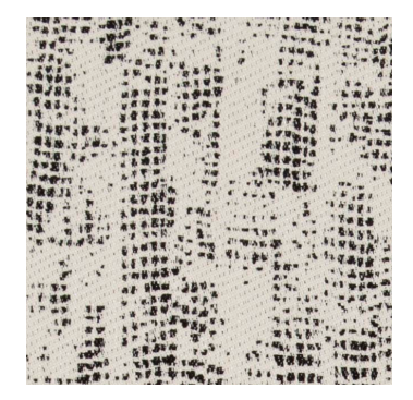
VERSE FABRIC IVORY/ONYX GWF 3735.18