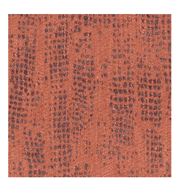
VERSE FABRIC CLAY/GRIS