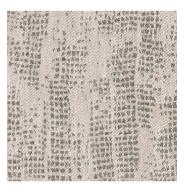
VERSE FABRIC SALT/PEPPER GWF 3735.11