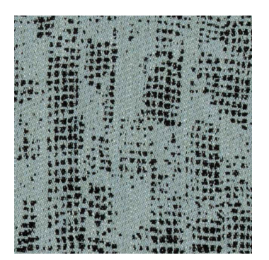
VERSE FABRIC ICE/ONYX