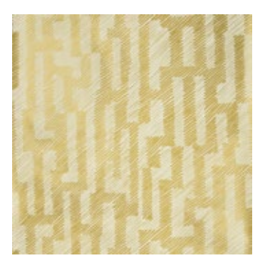
VERGE GILDED/IVORY GWP 3702.140