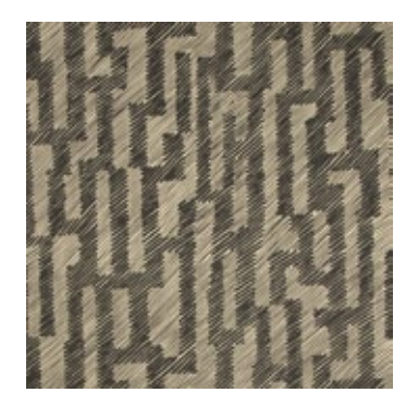
VERGE EBONY/IVORY GWP 3702.18