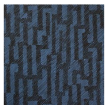
VERGE EBONY/COBALT GWP 3702.58