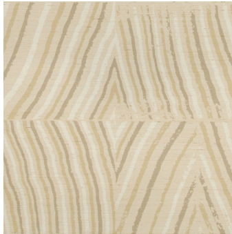
POST NATURAL GWP 3717.116