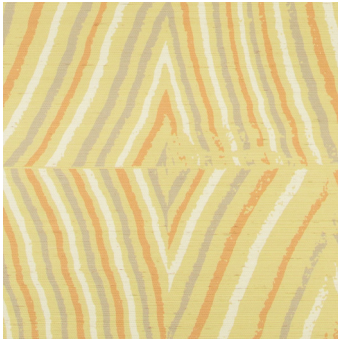
POST GLOW GWP 3717.401