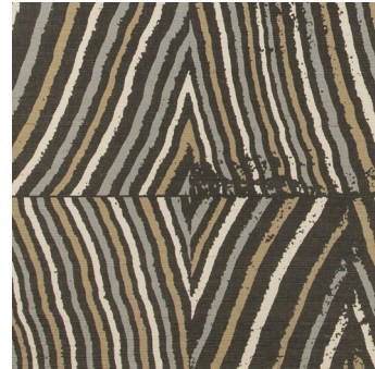
POST SHADOW GWP 3717.811